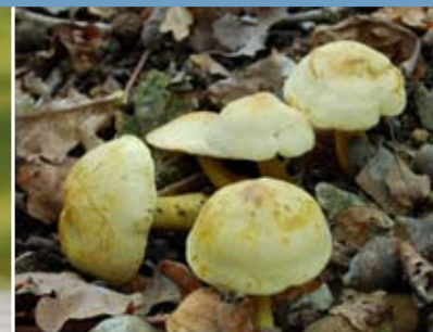
Nature Discovery Centre